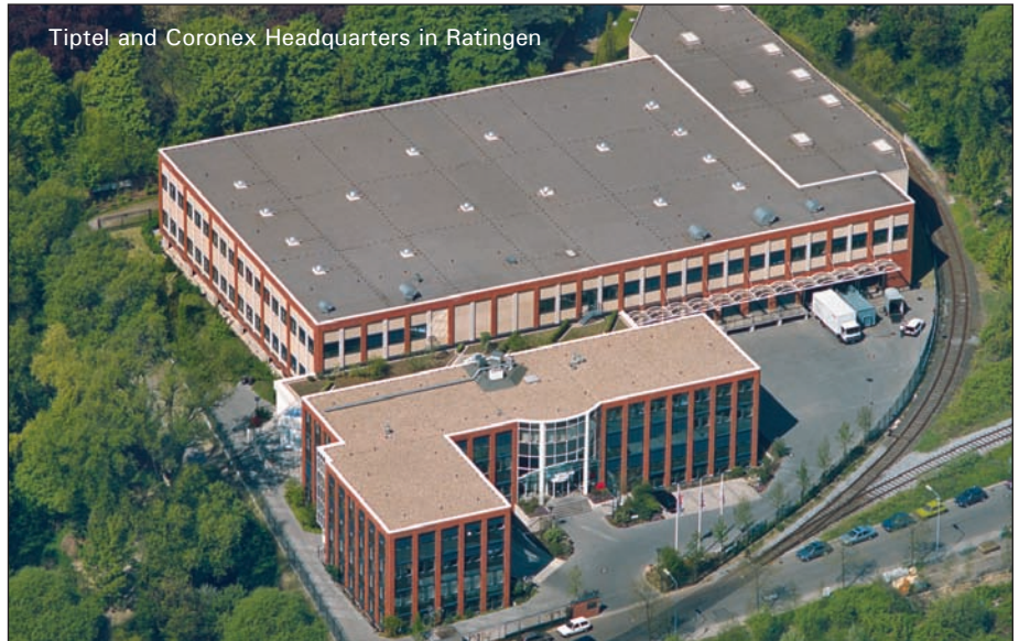
Tiptel and Coronex Headquarters in Ratingen

Tiptel AG, Regensdorf, close to Zurich, Switzerland